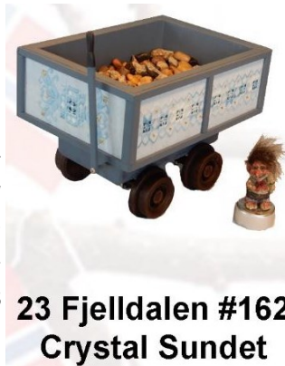
23 Fjelldalen #162 Crystal Sundet

District Six and its individual lodges offer numerous ways to connect to your heritage, learn about the culture (past and present) of Norway, share and/or enrich your folk art skills, and enjoy the camaraderie of others with similar interests.