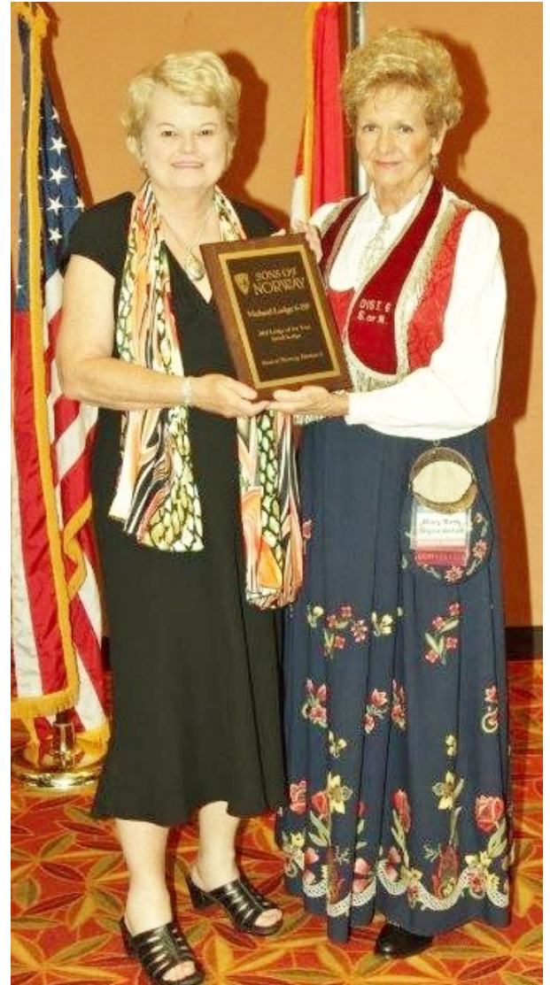
SMALL LODGE OF THE YEAR