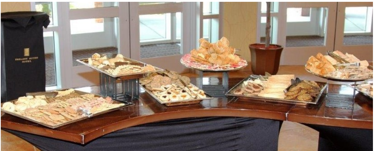
~~~~~ All morning and afternoon coffee breaks offered a splendid array of Norwegian goodies. Mange takk to our Colorado Host Lodges!