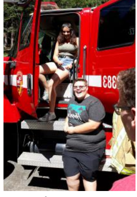
The 2019 campers visit Cal Fire

A great place to practice Norwegian Folk Art is at Camp Trollfjell and Trollfjell Folkehøgskule. All of the art pieces featured above were created at Camp. Art is only part of the activities for you at camp. Field trips, field games, swimming, cooking, and crafts are also part of the camp experience. Join us for some summer fun! To register now click HERE .