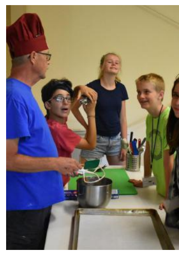
The 2018 Camp Trollfjell campers make gingerbread