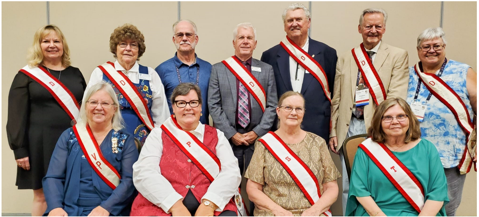
Sons of Norway's District Six Board of Directors pictured at the 2024 Convention and Lodge meeting.